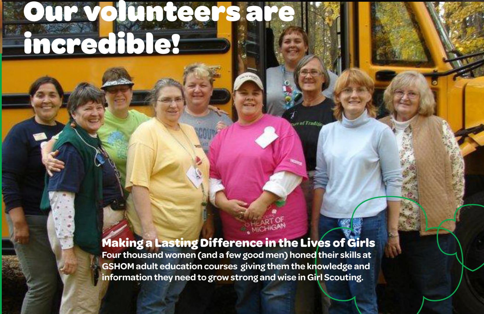
Making a Lasting Difference in the Lives of Girls Four thousand women (and a few good men) honed their skills at GSHOM adult education courses giving them the knowledge and information they need to grow strong and wise in Girl Scouting.