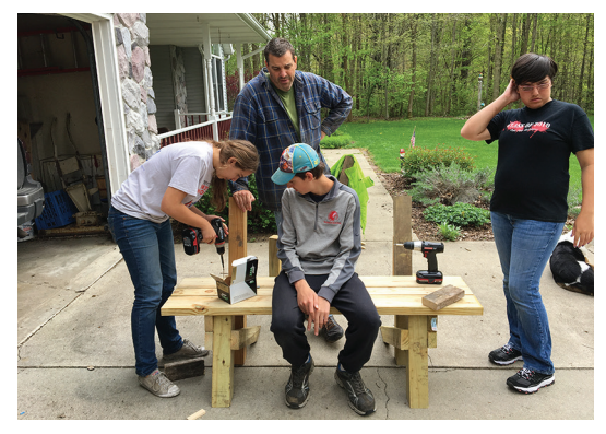
Gold Award Girl Scouts represent our most successful and engaged—and happiest—Girl Scout alumnae.

This year: 26 Girl Scouts became Gold Award Girl Scouts 44 Girl Scouts earned the Silver Award 63 Girl Scouts earned the Bronze Award