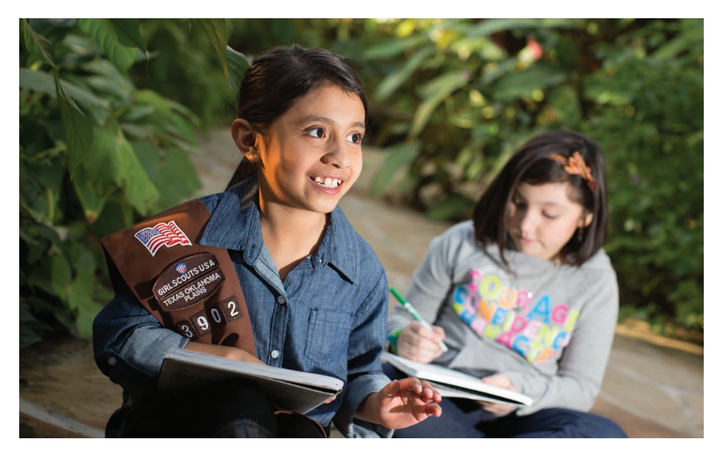
Thank you to our many generous supporters.