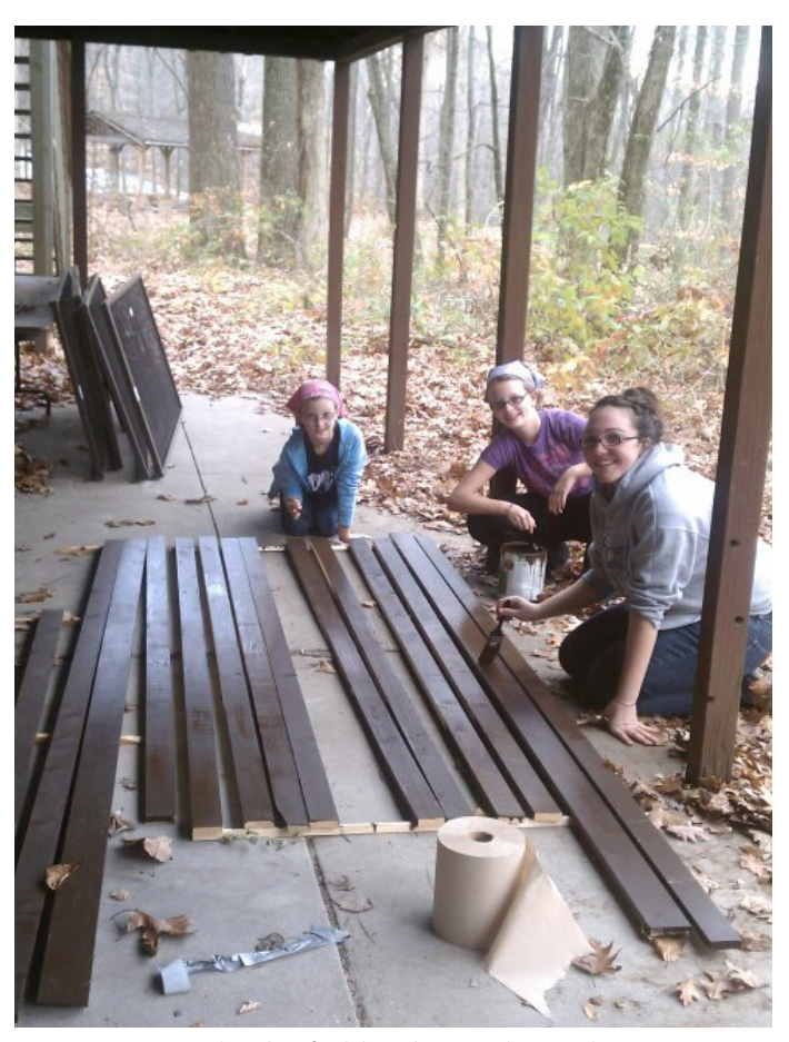
Troop 80899, Friends of Old Lodge , work together on a restoration project.