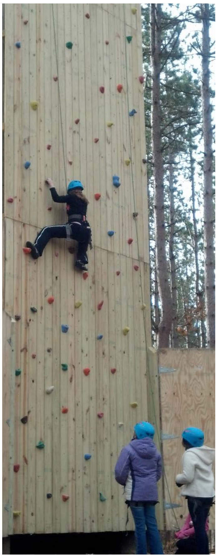
A troop checks out the new climbing wall at Camp Merrie Woode.