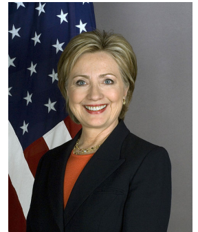
Hillary Rodham Clinton in 2000.

The 2000 census enumerates a population of 281,421,906, increasing 13.2% since 1990. As regions, the South and West continue to gain population, moving the geographic center of U.S. population to Phelps County, Missouri.