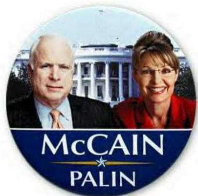
2008 Campaign Buttons