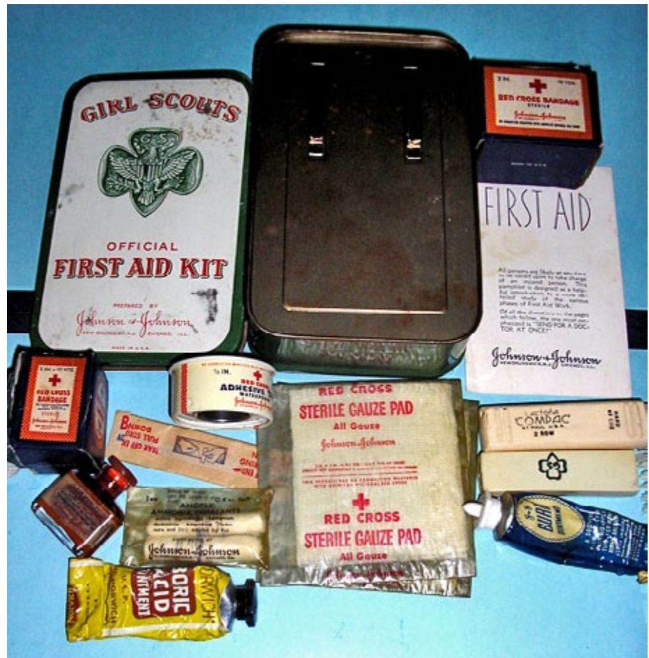
1950s Girl Scout First Aid Kit

NBC airs The Tonight Show , the first late-night talk show, hosted by Steve Allen.