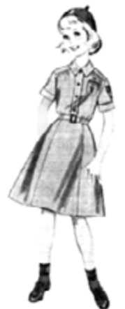
Brownie uniform 1956

The first world center for Girl Guides and Girl Scouts in the Western Hemisphere, Our Cabana, opens in Cuernavaca, Mexico.