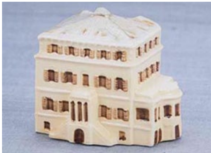
Model of Low Birthplace

The Soviet Union launches the “Sputnik” space satellite and the “space race” begins.