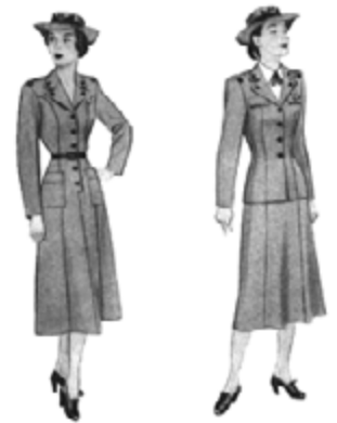
Girl Scout Adult Dress and Suit 1948

The 22nd amendment is passed. This amendment sets a term limit for the President of the United States: "No person shall be elected to the office of the President more than twice, and no person who has held the office of President, or acted as President, for more than two years of a term to which some other person was elected President shall be elected to the office of the President more than once."