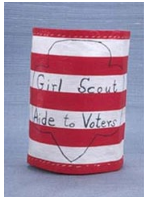
Aide to Voters Armband

The March 1952 issue of Ebony magazine reported: "Girl Scouts in the South are making steady progress toward breaking down racial taboos." What does this mean? Do you think this is still the case? Why or why not? If you do agree with this statement, how do you think Girl Scouts accomplishes this?