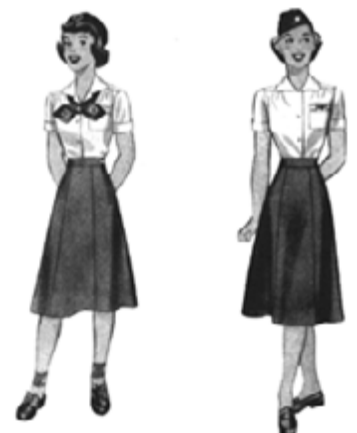
Intermediate Girl Scout Alternate uniform 1951

The March 1952 issue of Ebony magazine reports: "Girl Scouts in the South are making steady progress toward uniform 1956 breaking down racial taboos."