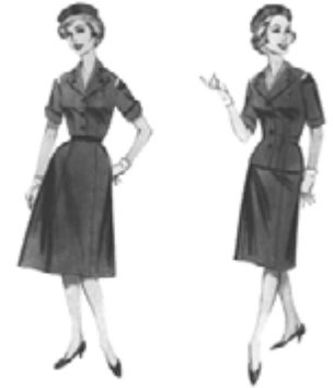
Girl Scout Adult Dress 1953 and Suit 1956

The adult green dress uniform features a Shirred back, tapered sleeves, slant pockets, and a raised neckline with white pique trim. The 1956 adult green suit has short sleeves, adjustable side tabs, and buttons on the collar and lapels. Two additional new hats—a pillbox beret in fine fur felt, designed by Sally Victor, one of America’s foremost millinery designers, and a soft beret in green acetate and rayon gabardine--are developed for adults.