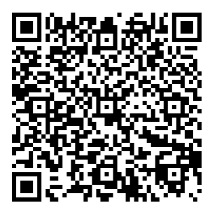
Scan to join Rallyhood today!

There are Leadership Journeys for each grade level, and each is customizable to your interests. Each one also has a corresponding adult guide for your mentor. Combined with the Source, our program guide, you will be ready for anything, whether that be girl awards, camp, travel, or the Product Program.