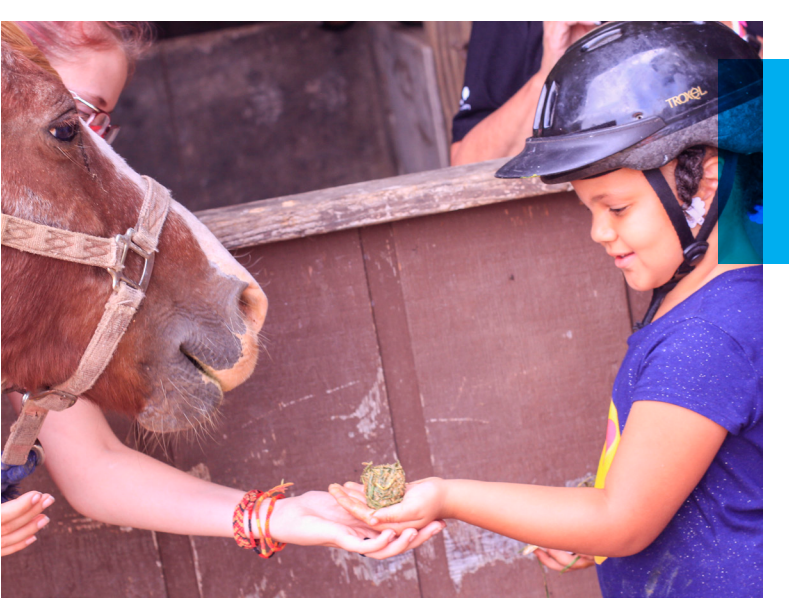
Find a list of our properties you can visit on page 11!