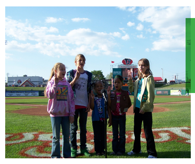
Find a list of our properties you can visit on page 11!