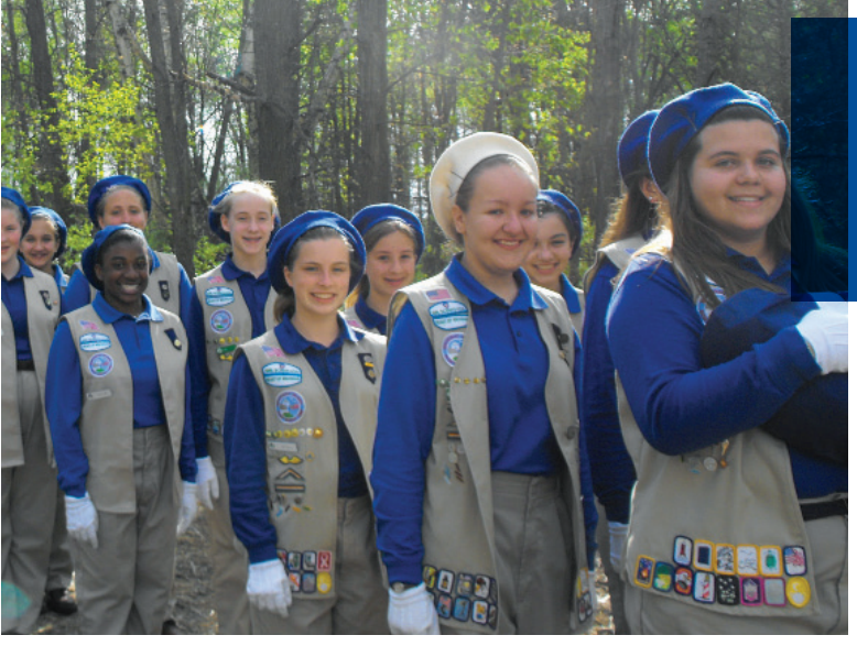
You can join either troop 609 or 7901! Applications are on gshom.org

Experience new cultures and learn from Girl Scouts and Girl Guides worldwide! You can travel with Girl Scouts Heart of Michigan and Girl Scout Destinations through Girl Scouts of the United States of America.