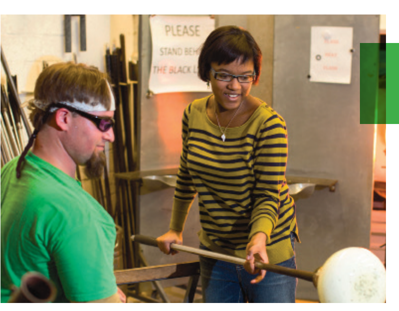
There are five World Centers Girl Scouts can visit!

We have new camp guides every summer! Check 'em out at girlscoutcamp.org!