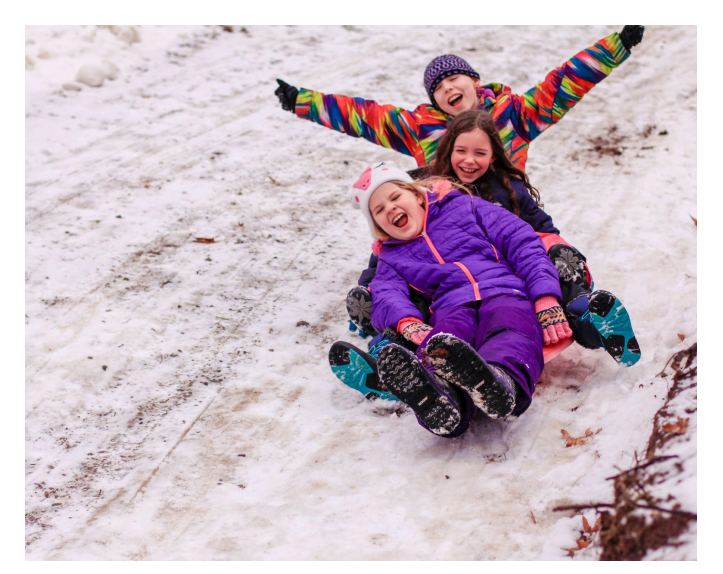
Teamwork makes the dream work!

Cooperative Learning inspires a team atmosphere where girls can coordinate, cooperate, collaborate, and communicate, while building support for themselves and empathy for others. Through kind, mindful, and considerate dialog through a troop setting, camp, or at a council program/event, girls learn team work, democratic process and group dynamics, and problem solving. To become well adjusted, girls need the freedom to make mistakes, solve problems and "have a go" at sorting out challenging situations in a supportive safe atmosphere and Girl Scouting has just such an environment.