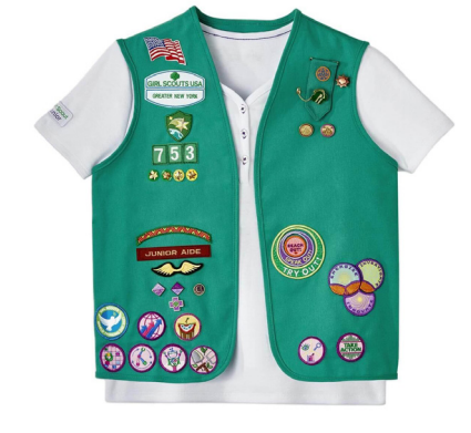
Juniors Grades 4-5