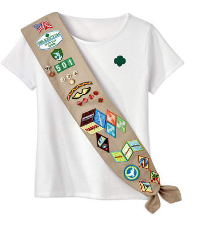
Cadettes Grades 6-8