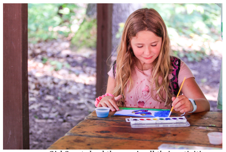
Girl Scouts lead the way in all their activities

The three operational program model processes in Girl Scouting are: 1) Girl-Led; 2) Experiential Learning or hands-on learning; and 3) Cooperative Learning.