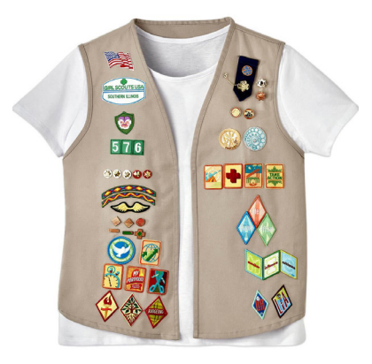
Seniors -8 Grades 9-10