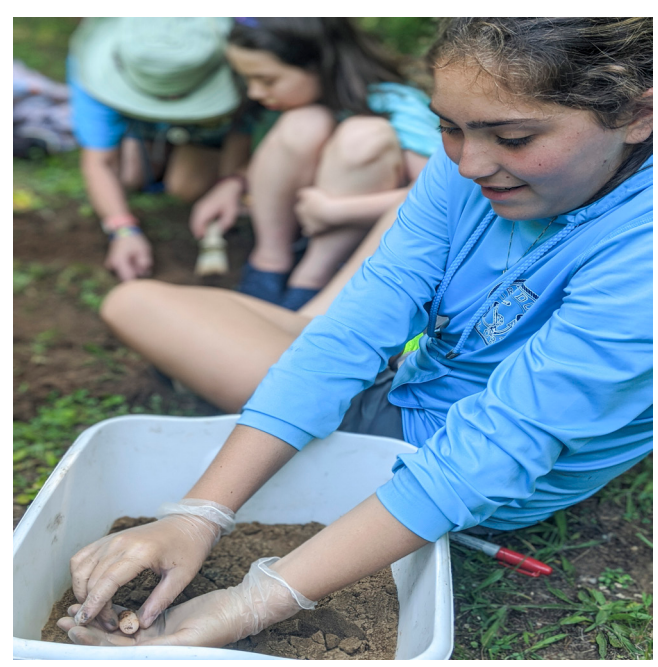
Hands-on is the most fun way to learn!

Safe girl-led Girl Scout experiences allow girls to try new things and learn new skills which, inturn, builds their confidence and strengthens their internal locus of control. Girl-led guides girls toward courage, independence, and resourcefulness.