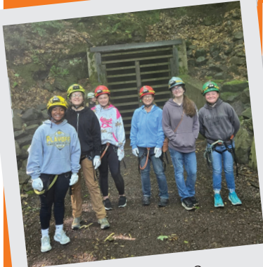
Troop 60138 Adventure Mining in the UP