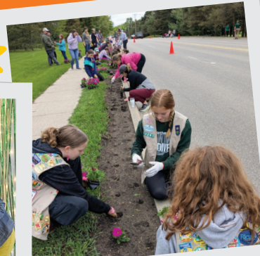
Service Unit with various troops at Midland Blooms