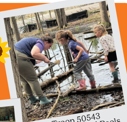
Troop 50543 Exploring Vernal Pools at Chippewa Nature Center