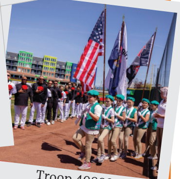
Troop 40889 Color Guard Flag Ceremony at Lansing Lugnuts Game