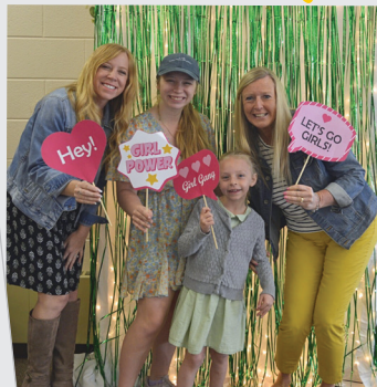
Service Unit 804 Mother's Day Tea Party