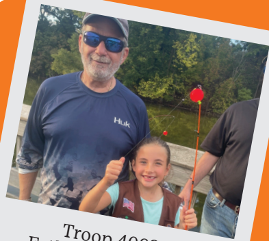
Troop 40920 Father's Day Fishing